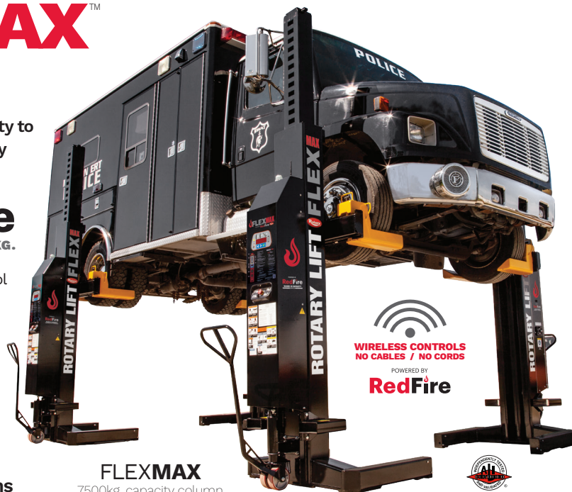
FLEXMAX 7500kg. capacity column